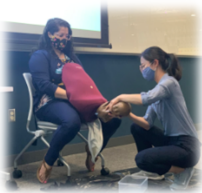
Postpartum Hemorrhage Workshop