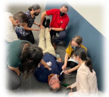
SUGAR Global Health Simulation: Tying together multiple concepts learned during the course