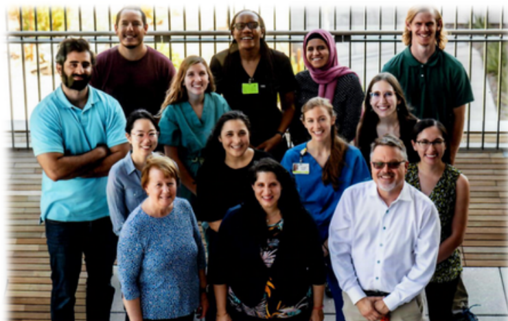
Global Health Class of 2021

The Clinical and Community Care Course is a 3-week course that has been taking place since 1982. It aims to prepare clinical students and residents for health care experiences in developing nations. This past year, the class was offered in person and virtually. Overall, 52 participants were enrolled in the course! Medical students, pharmacy students, and residents from the University of Arizona, the University of Connecticut, the University of Washington, the Marshall University Family Medicine Residency Program, and the University of Pittsburgh Medical Center joined together to learn from this educational experience. Several international colleagues were able to participate as well! The course featured 45 guest instructors, many from around the world. Multiple case-based interactive sessions were provided to further develop medical skills that are critical for patient care in low resource settings.